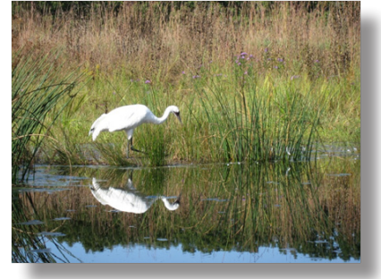
The long-term goal of the Whooping Crane Eastern Partnership is the reintroduction of a self-sustaining migratory whooping crane population in eastern North America.

The Science: The project will proceed in 3 stages: demographic estimation, initial model development, and integration of management decisions and challenges. The first stage will involve estimation of demographic parameters to be used in later population modeling phases. Demographic parameters describe rates of survival, reproduction, and movement in populations. The second stage will be initial model development, involving integration of the demographic parameter estimates into a basic model. Parameter estimates based on the results of the demographic analysis will be used to form a basic population simulation model for use in population projections and viability analysis. The third stage will be an integration of management decisions and challenges into the model, which will involve adding additional complexity to the model to examine potential impacts of future management decisions. Some analyses will include: breeding and release decisions with respect to genetic indicators, and the impact of genetic indicators on population success; impact of breeding season dispersal on project success, and strategies for addressing dispersal; and impact of management strategies for improving reproductive success.